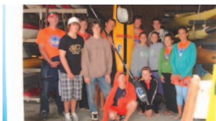
Western Canada Summer Games granted the Selkirk Canoe Kayak Centre $1,584 to purchase turbo paddles For the Kids Program.