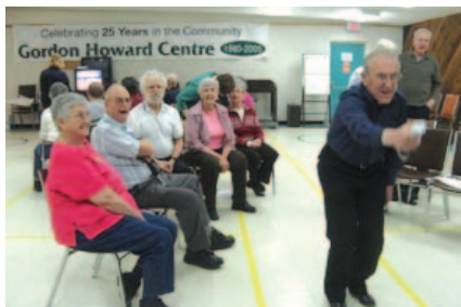
Gordon Howard Centre received $4550 to help with renovations to their multi-purpose room.