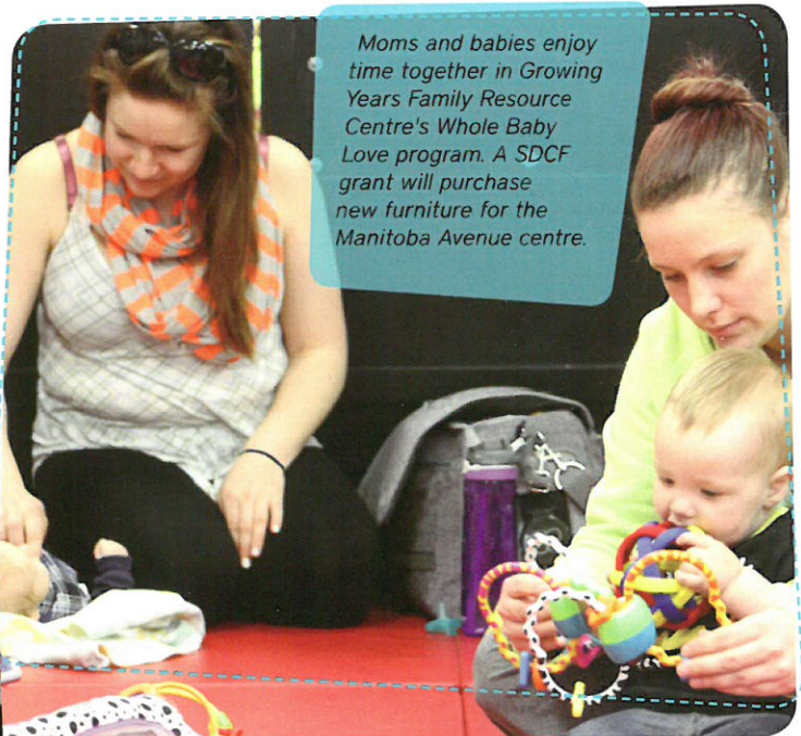
Moms and babies enjoy time together in Growing Years Family Resource Centre's Whole Baby Love program. A SDCF grant will purchase new furniture for the Manitoba Avenue centre.