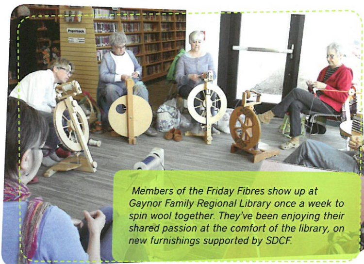
Members of the Friday Fibres show up at Gaynor Family Regional Library once a week to spin wool together. They've been enjoying their shared passion at the comfort of the library, on new furnishings supported by SDCF.