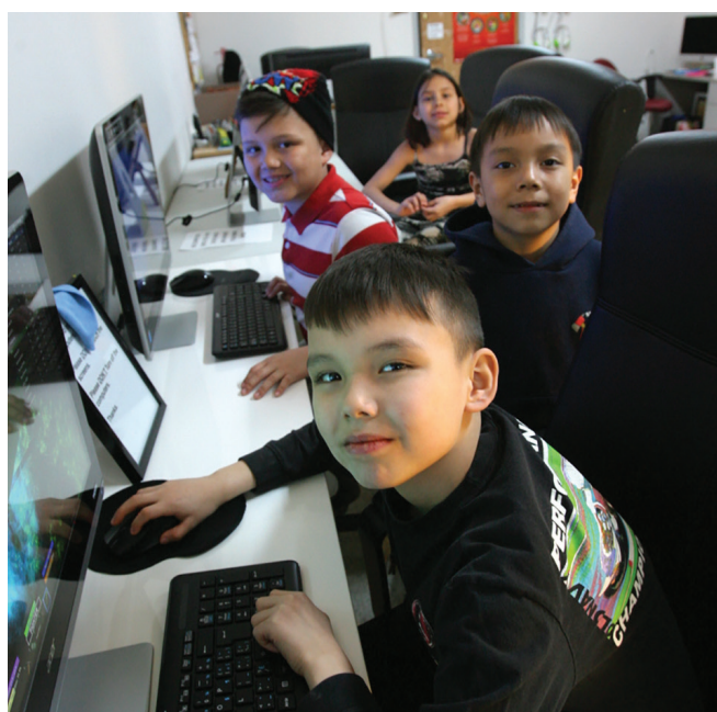
There are lots of smiling faces at the Selkirk Friendship Centre's After School Program with the arrival of new computers.