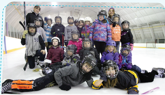
Robert Smith School students have new skates, helmets and sticks to use during their Wednesday afternoon skate, thanks to a SDCF grant.

"Kids that we hadn't seen in a couple years, that maybe had skates passed down to them, they're back skating again since the equipment's come in."