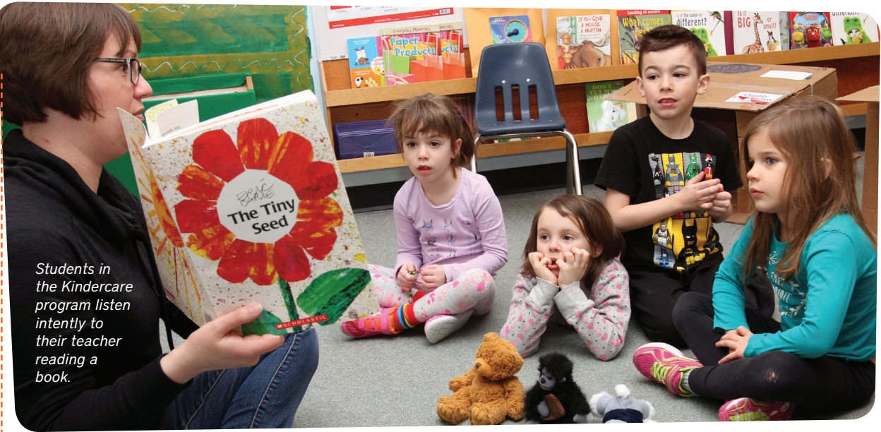
Students in the Kindercare program listen intently to their teacher reading a book.

The before and after-school program starts at 7:15 am and goes until 6 pm and is open to students who attend William S. Patterson.