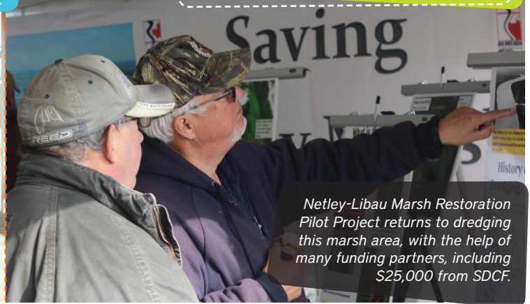
Netley-Libau Marsh Restoration Pilot Project returns to dredging this marsh area, with the help of many funding partners, including $25,000 from SDCF.

Folks who live in the Red River North region have long called for the return of dredging to the river. In fact, there's been a rallying cry for it virtually since it was abandoned by the federal government in 1999.