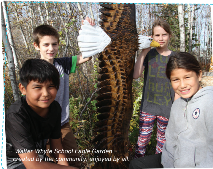
Walter Whyte School Eagle Garden – created by the community, enjoyed by all.

Twice a year the SDCF welcomes charitable organizations in the region of Selkirk and the rural municipalities of St. Clements and St. Andrews to submit proposals on how we can help them achieve their wishes and dreams. In 2017-2018 we funded 53 projects, with future granting and flow through donations, a total of $ 311,034.