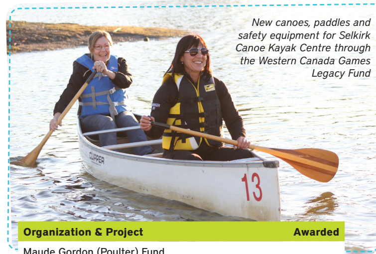
New canoes, paddles and safety equipment for Selkirk Canoe Kayak Centre through the Western Canada Games Legacy Fund