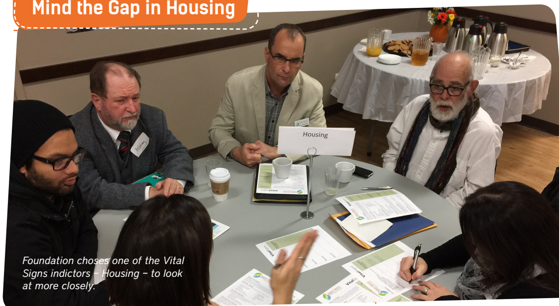
Foundation chooses one of the Vital Signs indicators – Housing – to look at more closely.

Two and a half years ago the SDCF rallied the community for a deep dive into our community wellness. Together we produced a Vital Signs report called Mind the Gap, where we looked at the gaps that are in our region.