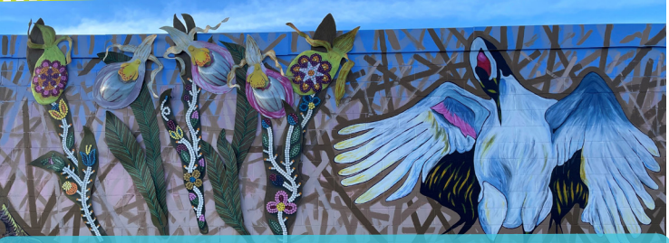
This mural, in a Selkirk Manitoba Avenue pocket park, is eye catching and w created with the help of an SDCF grant; St. Clements' East Selkirk Legacy Park is the recipient of a grant that will allow for a mural to be created there.

The East Selkirk Legacy Park is the most apropos of places for a new 560-square-foot Community Spirit Mural and by next summer it will be