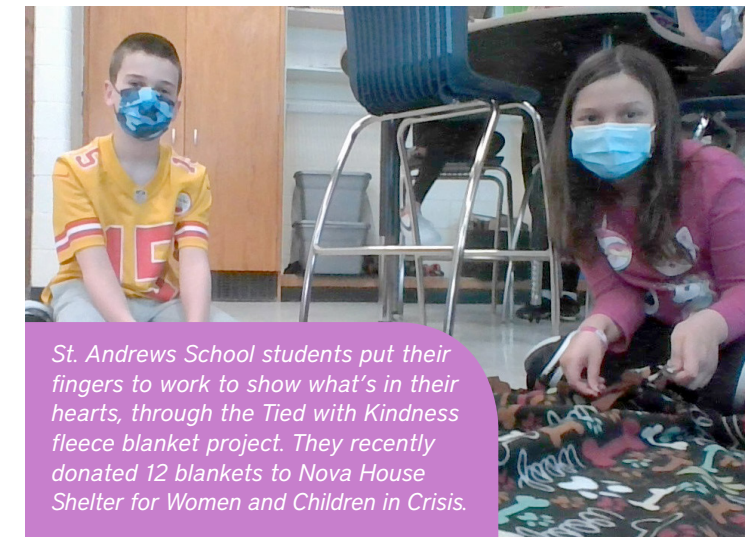
St. Andrews School students put their fingers to work to show what's in their hearts, through the Tied with Kindness fleece blanket project. They recently donated 12 blankets to Nova House Shelter for Women and Children in Crisis.