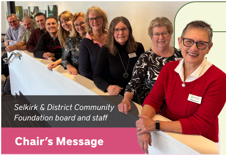
Selkirk & District Community Foundation board and staff