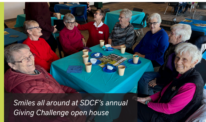
Smiles all around at SDCF's annual Giving Challenge open house