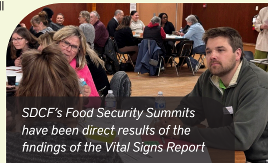
SDCF's Food Security Summits have been direct results of the findings of the Vital Signs Report

If you need a copy of Vital Signs, email selkirkfoundation@shaw.ca .